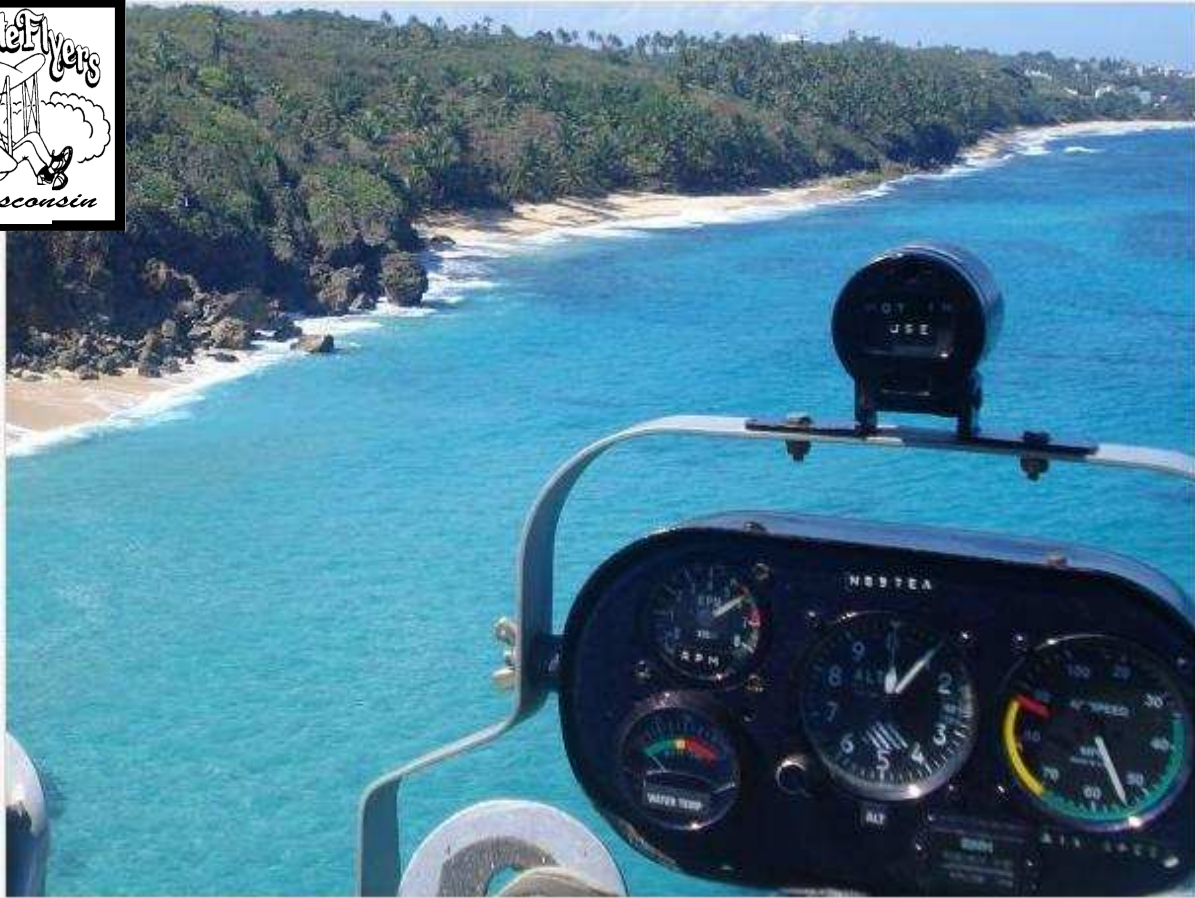
How's this for some flying scenery? This photo was taken from a Quicksilver Sport IIS in San Juan Puerto Rico.